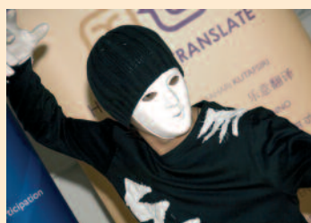
Grampian Housing Association launch

If you would like to receive information about applying for membership, please contact the Happy to Translate Logo support team on 0131 444 4950/1 or e-mail info@happytotranslate.com