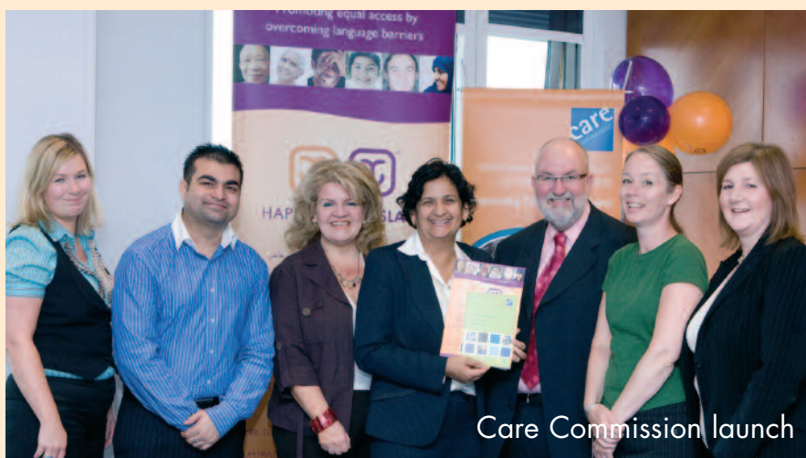
Care Commission launch

This brings the total member organisations number to 21. The Happy to translate logo team continues to promote the Logo at various exhibitions, conferences and community events around the country. Recently launches were held by the new member organisations, The Care Commission and the Grampian Housing Association. The launch party has proven to be a most effective platform for organisations to raise awareness of their new membership status.